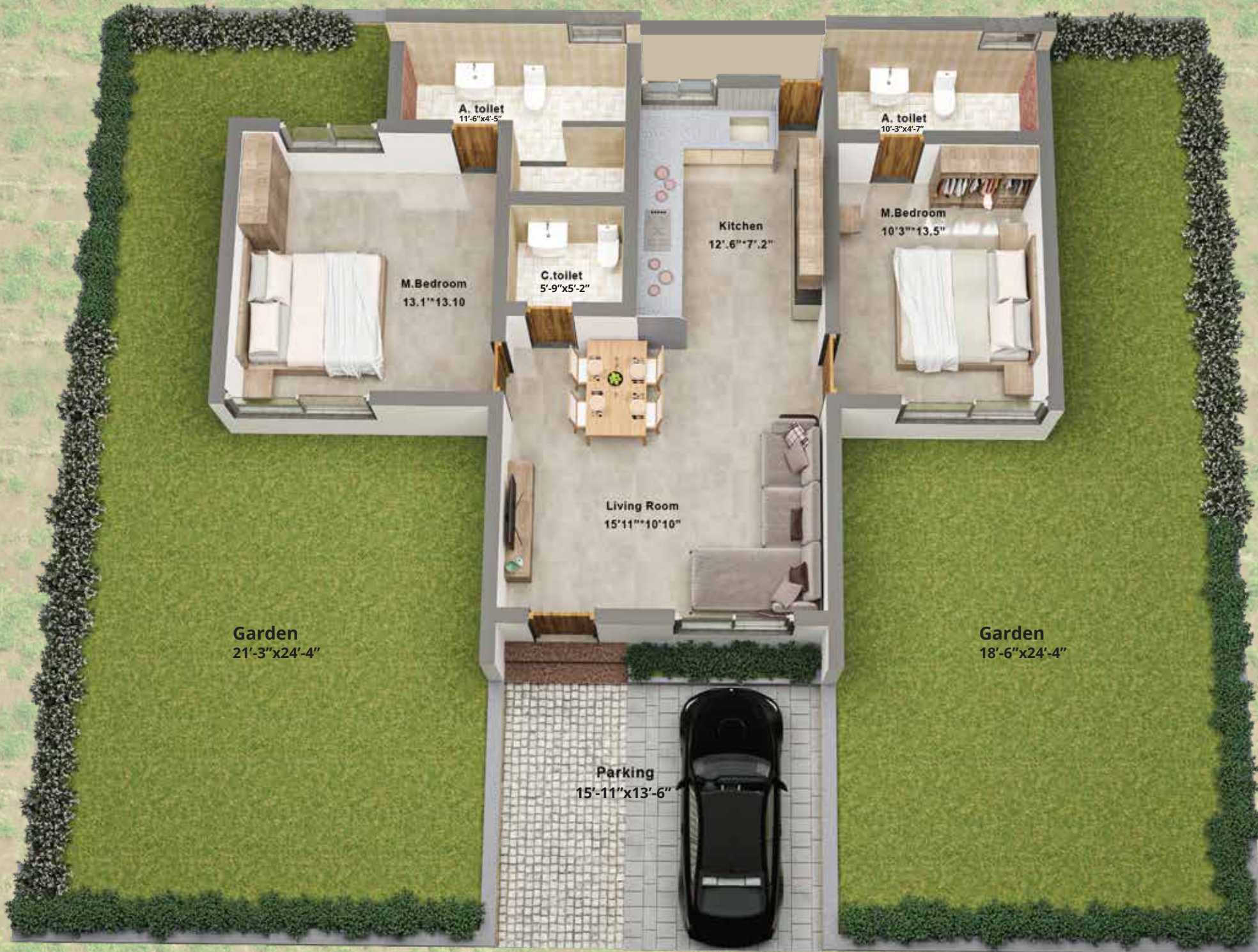
2 BHK Layout