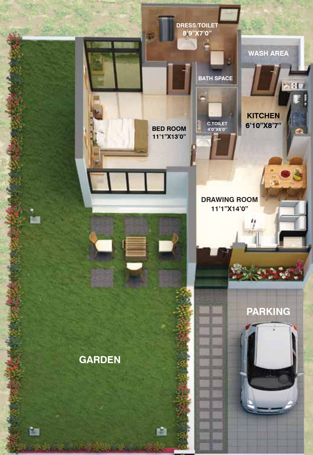
1 BHK Layout